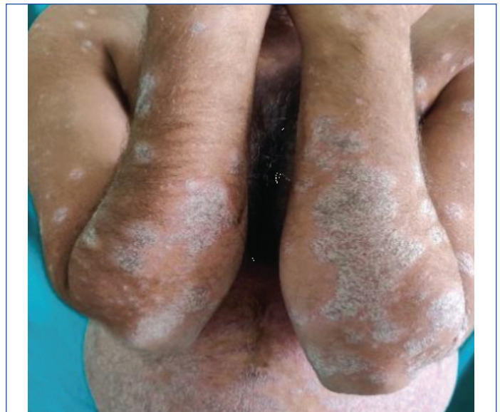
[Table/Fig-2]: Showing chronic plaque-type psoriasis involving upper limbs and trunk.

Out of the 3,012 patients, 10 patients were diagnosed with ILD. The median patient age was 51.5 years (range: 25-65 years). The median time for the development of respiratory symptoms from diagnosis of psoriasis was 24.5 months (range: 6-60 months). The median Forced Vital Capacity (FVC) percentage predicted was 58% (range: 32-85), and DLCO% predicted was 42% (range: 23-79) [Table/Fig-1]. All patients had chronic plaque-type psoriasis [Table/Fig-2]. The most